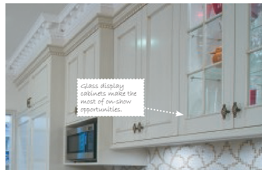
Glass display cabinets make the most of on-show opportunities.