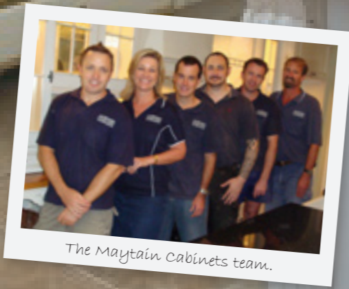
The Maytain Cabinets team.

Note the detailed Farmers intermediate moulding at the base of the glass cabinets — so classy!