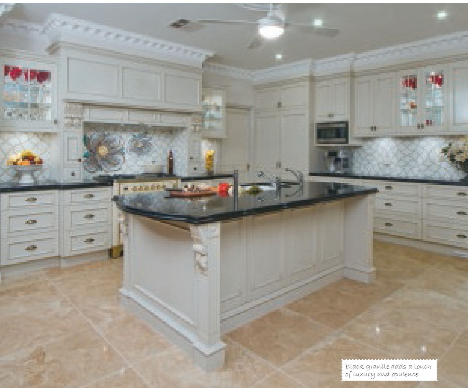
Black granite adds a touch of luxury and opulence.

This kitchen is much more than just a meals preparation area — it's the heart of this family home